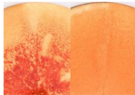
without SETAVIN PE