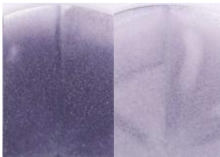
without SETAVIN PE