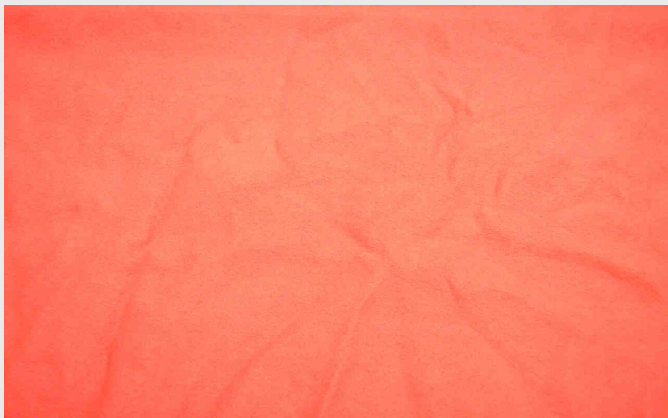
no anticrease agent