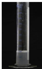
TISSOCYL CFD conc

Stamping test method: 1.0 g/l detergent 1.0 g/l soda ash, 25 C