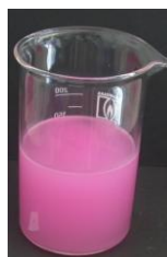
TISSOCYL CFD conc